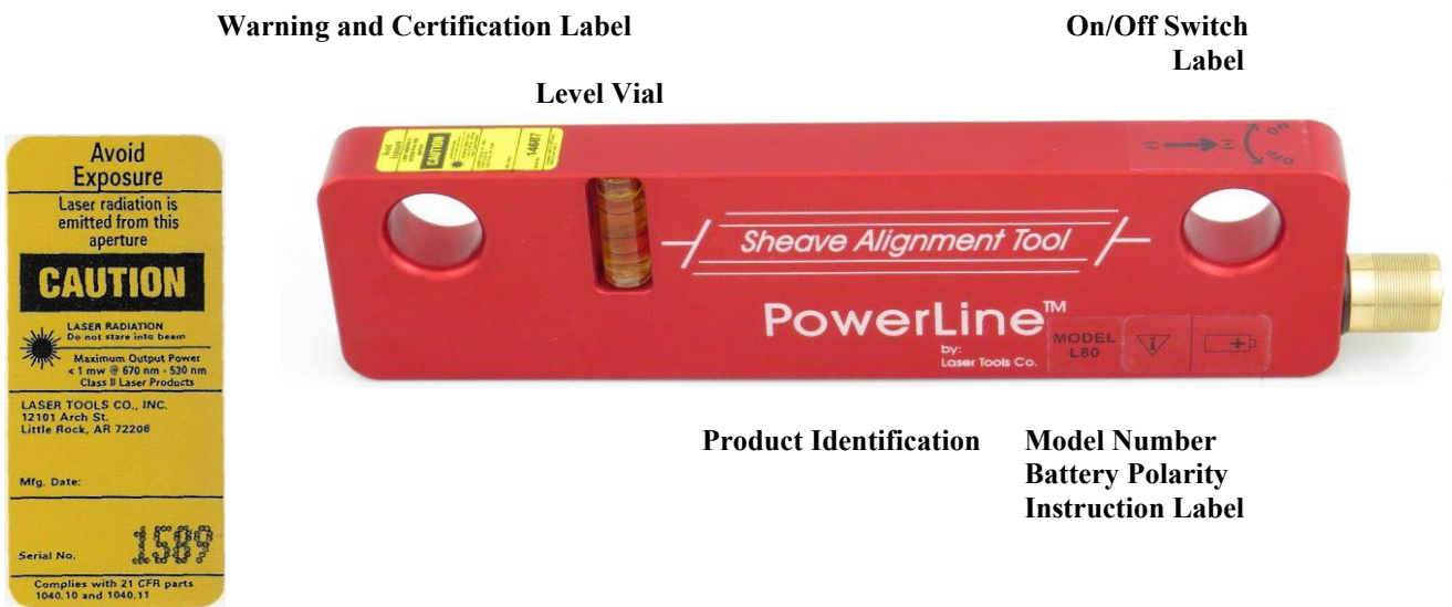
Warning and Certification Label

Its bottom machined surface mounts magnetically to the machined face of sheave, gear, etc. It projects a 1/16” thick laser reference line over a wide angle. The projected reference line is parallel to the machined bottom surface and offset from it by 0.312”.